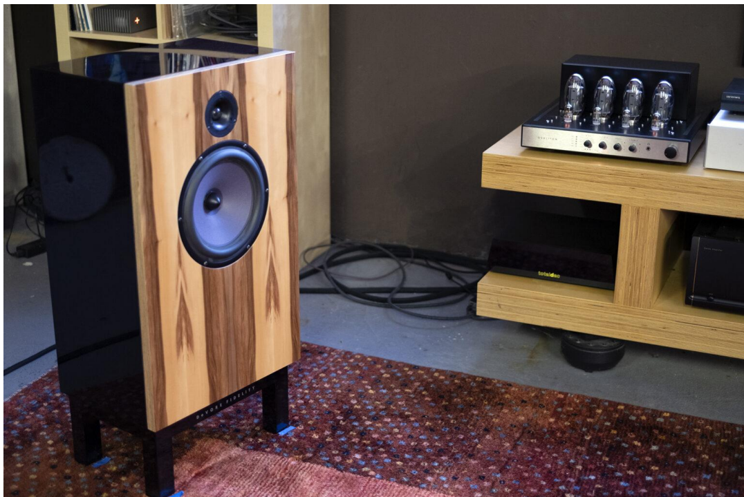
with the Audio Hungry Qualiton X200 Integrated Amplifier

This freedom in partnering is due to their friendly load, represented by DeVore as 96 dB/W/M (that's where they get the "96" part of their name), with a higher than typical nominal impedance of 10 Ohms and a claimed frequency response of 26Hz-31kHz.