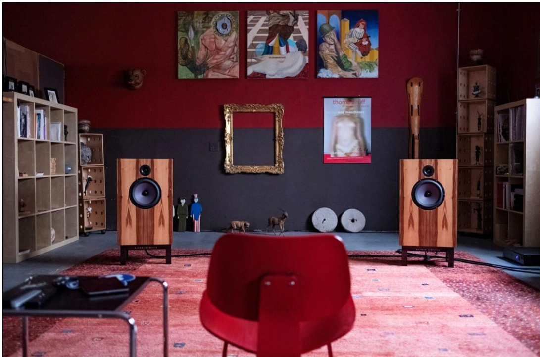
I happen to think the O/96 are simply lovely to look at from every angle and distance.