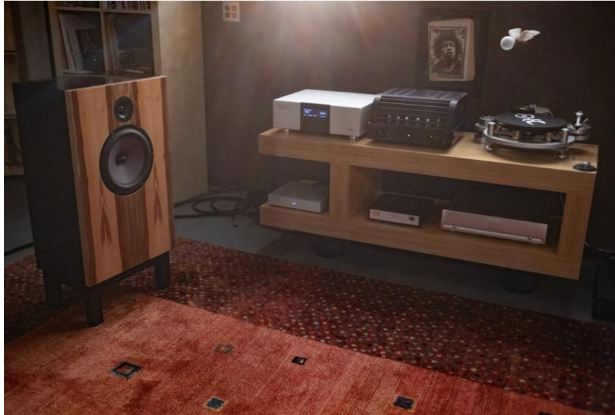
with the PrimaLuna EVO 300 Hybrid Tube Integrated Amplifier

I've certainly heard speakers that can move more air, that offer even greater physicality, but this additional whomp has always come at the expense of the O/96's grace and seamlessness, their ability to convincingly create low end electronic growl, richly hued timbre, lighter than air movement, and startling presence. By comparison, some larger multi-driver speakers have sounded boisterous at the expense of balance and nuance, two more of the O/96's standout strengths. In my experience, speakers that initially impress but lack grace and ultimate balance fail to hold my attention over time and in the worst cases limit the kinds of music I want to hear. The DeVore's work in the opposite fashion, even after two years of constant use, inviting the limitless exploration of what ever music I care to hear.