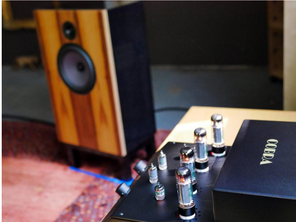
with the Audio Note Cobra Integrated Amplifier

No matter the record, regardless of genre, regardless of recorded quality, I know that whatever music I play through the O/96 will be brought into the Barn in living form for all my senses to enjoy. No holds barred.