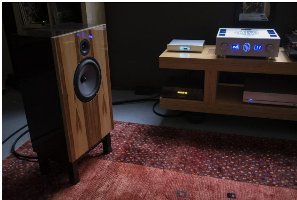
with the ModWright KWH 225i Hybrid Integrated Amplifier

My daily driver for the DeVore's is the Leben CS600 integrated amplifier, which I've outfitted with 4 Genalex Gold Lion KT77s for about 30 Watts of power, and this combination is as winning a combo as I've heard. Lush, luscious, spider web fine, big wave power. With the Leben CS600, the DeVore's come alive just above whisper levels and can rise up to Barn shaking power in a flash. Like lightning.