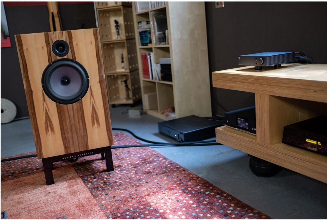
with the Enleum AMP-23R

The DeVore O/96 are from the company's Orangutan line, that's where the big "O" comes from in their name. There are now four other speakers in this line including the similar and smaller O/93, which I owned prior to the O/96's arrival, the O/baby, the diminutive cube of a speaker, the micr/O, and the O/Reference flagship. DeVore also makes the gibbon line that includes the more commonly proportioned gibbon Super Nines and gibbon X floorstanders. I used to own the gibbon X and an older incarnation of the Super Nines called just The Nines and going back even further, a pair of gibbon Super 8s.