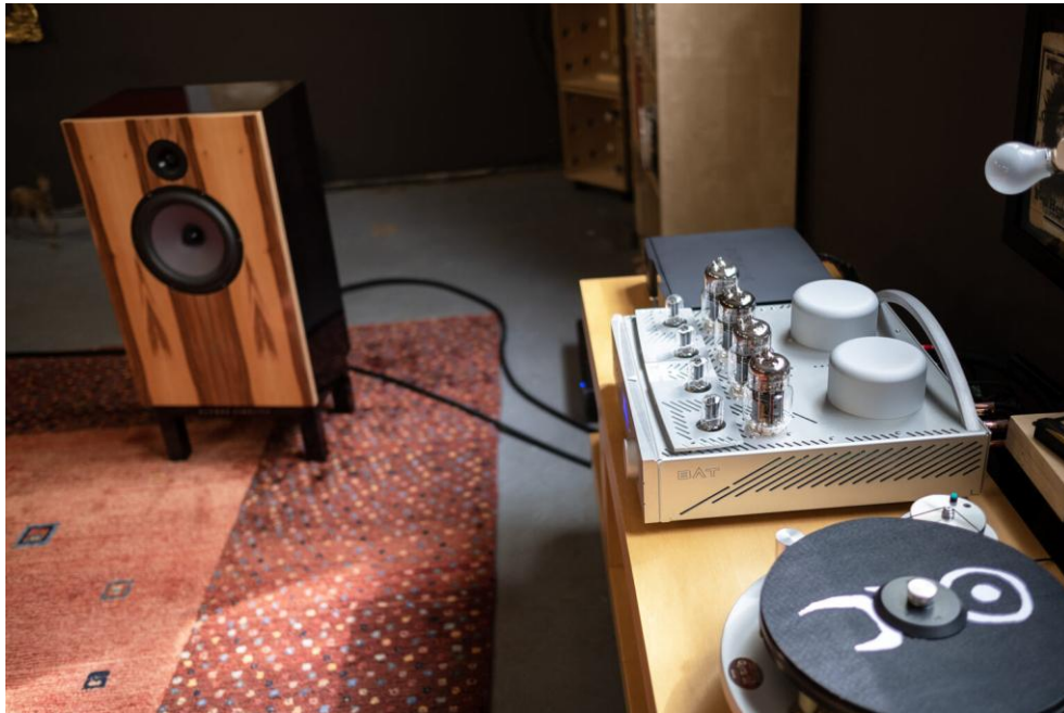
with the BAT VK-80i Integrated Amplifier

Let's redefine high fidelity as being faithful to the passion for and discovery of music. This means that the best hi-fi is the one that perpetually fans the flame of this passion.