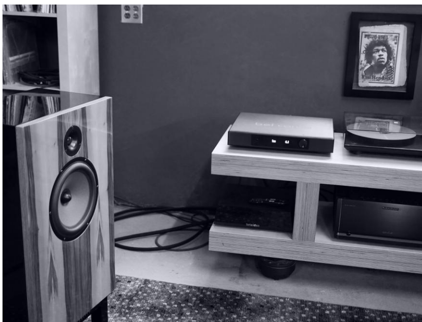
with the Bel Canto E1X Integrated Amplifier

Regular readers, and even more so people who follow the TM Instagram feed Stories where I post a track a day (every day), know that I listen to a lot of music and a lot of different kinds of music. My taste in music is omnivorous and I've been listening to records, in one form or another, most days for the last 50+ years of my life. Music is, for me, an essential ingredient of the day and my hunger for it never wanes. Like food, music is sustenance. And when I want to plug into whatever music has captured my attention, I know that the DeVore O/96 will deliver what it has to offer, from whisper to power, all rich, delicate, and bruising, as emotionally and physically involving as I want things to get.