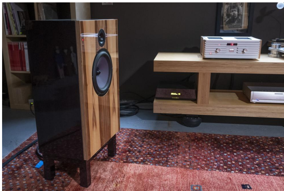
with the Soulnote A-2 Integrated Amplifier

In Barn, every speaker needs care in placement and I'd say this is the case for every speaker in every room and the O/96 are no exception. Once dialed in, something I can now do in a few minutes since I know their sweet spot in Barn and have moved them in and out of it too many times to count, the O/96 disappear as well as any speaker I've heard anywhere. They also create a vast and perfectly constructed sound image, its exact size and specificity limited only by the information contained in the recording.