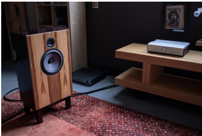
with the Mola Mola Kula Integrated Amplifier

More than most speakers I've had the pleasure to spend time with, the O/96 offer a direct connection to the humanness of the music being made, those aspects of music's communicative powers that exist beyond an accumulation of sounds, every single time I sit in front of them. For years on end, without fail.