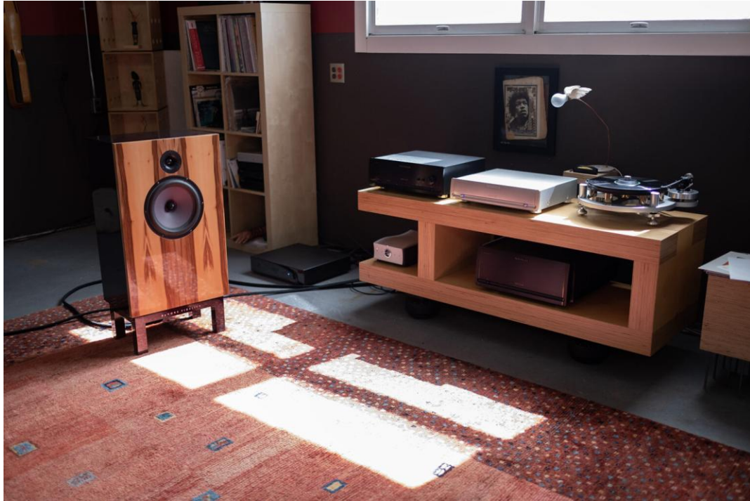
with the Parasound JC 5 Stereo Amplifier

Since they arrived two years ago, the O/96 have played partner to some 25 amplifiers of all shapes and sizes that have come through for review, from a few Watts to more than 400 Watts of output power. And that's one of the things I love about the DeVore O/96—they can play nice and lovely with a handful or a truckload of Watts. Tube, switching, or solid state.