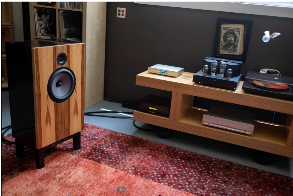
with the Feliks Audio Arioso 300B Integrated Amplifier

I'll begin my listening notes with an observation, one that is only afforded by living with the O/96 for years and being a hifi reviewer simultaneously—no matter the speaker here for review, regardless of the systems heard at shows, I am always excited to put the O/96 back into my system and just sit and listen. That's not to say they are somehow better than every speaker I've reviewed in some objective way, but that is to say their combination of strengths make the DeVore O/96 completely satisfying as a conveyor of music's heart and soul (cue Hoagy Carmichael).