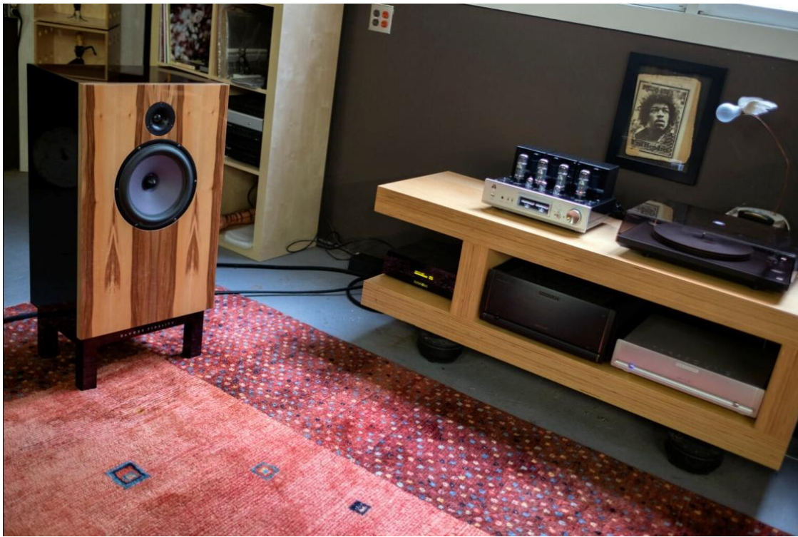
with the LSA VT-70 Integrated Tube Amplifier

I'll begin my listening notes with an observation, one that is only afforded by living with the O/96 for years and being a hifi reviewer simultaneously—no matter the speaker here for review, regardless of the systems heard at shows, I am always excited to put the O/96 back into my system and just sit and listen. That's not to say they are somehow better than every speaker I've reviewed in some objective way, but that is to say their combination of strengths make the DeVore O/96 completely satisfying as a conveyor of music's heart and soul (cue Hoagy Carmichael).