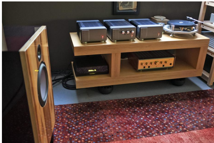
with the Riviera Labs APL10 Preamplifier & AFM25 Monoblock Amplifiers

I've also heard speakers that can go convincingly lower, some sporting powered subwoofers, and for people who crave rave bass, the DeVore's sub-30Hz in room response may not suffice. I'm more of a quality over subsonic rumble kinda listener so the O/96's bass response fulfills my needs.