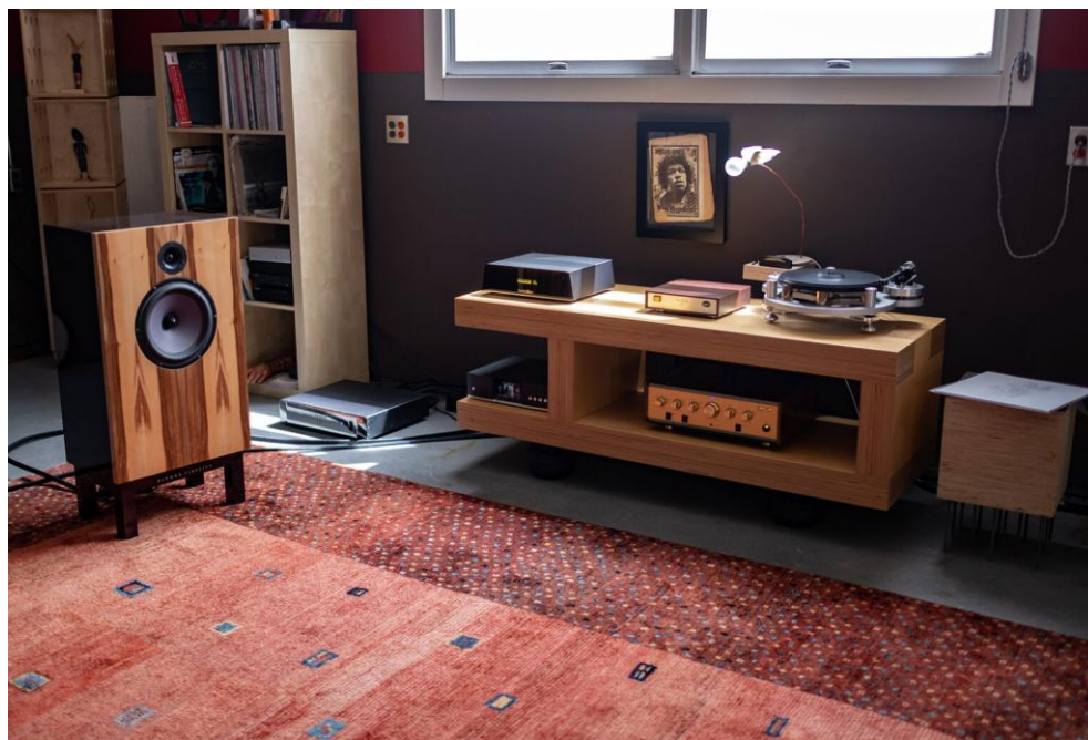
with the Leben CS600 Integrated Amplifier

Getting back to and expanding on an earlier thought, because the O/96 are so easy to drive, with just a few Watts if you so desire, they come alive at low volume levels. Music eases out of the O/96 and comes alive with stunning immediacy whether I'm listening low or loud.