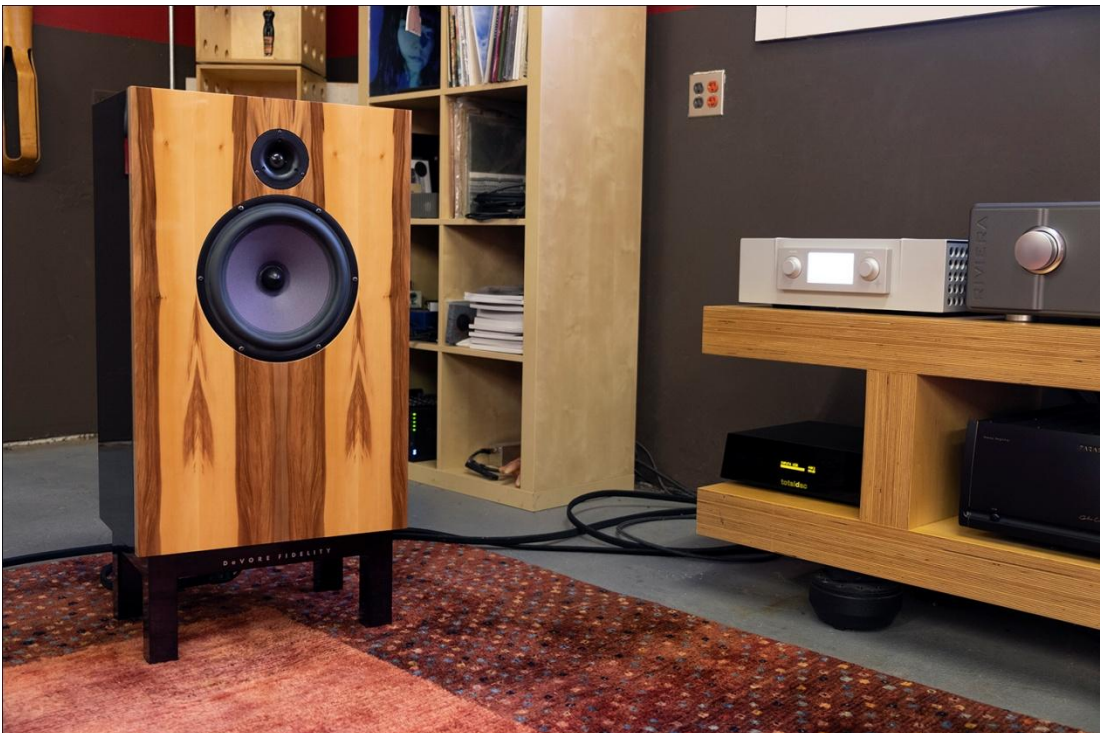
with the Constellation Audio Inspiration Integrated 1.0

The DeVore O/96 are from the company's Orangutan line, that's where the big "O" comes from in their name. There are now four other speakers in this line including the similar and smaller O/93, which I owned prior to the O/96's arrival, the O/baby, the diminutive cube of a speaker, the micr/O, and the O/Reference flagship. DeVore also makes the gibbon line that includes the more commonly proportioned gibbon Super Nines and gibbon X floorstanders. I used to own the gibbon X and an older incarnation of the Super Nines called just The Nines and going back even further, a pair of gibbon Super 8s.